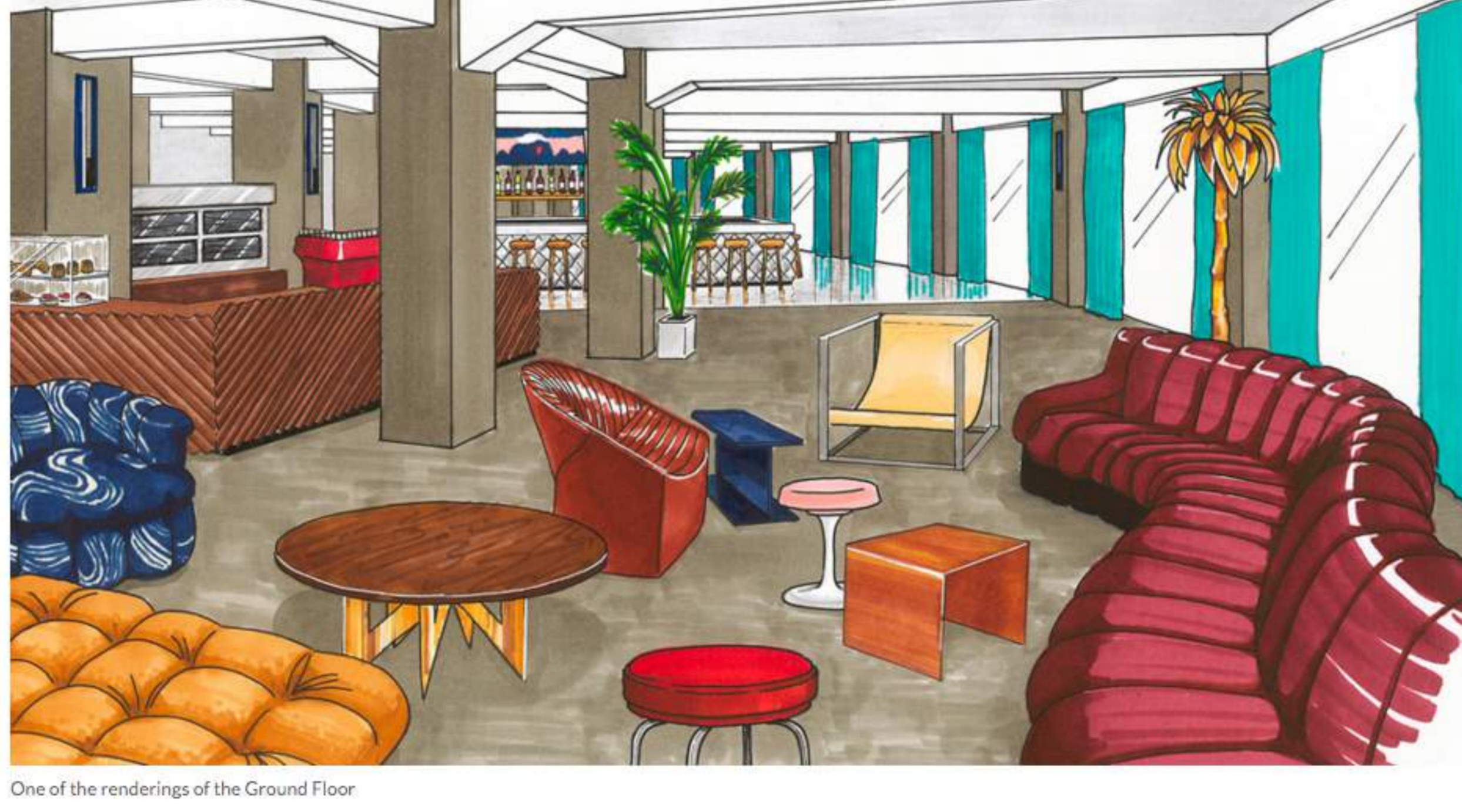
One of the renderings of the Ground Floor

Aside from its amazing location, I'd have to say the ground floor. Two restaurants, a café, a bar, a take-away and a karaoke room, all on the same level and in one big open space. It's going to be like nothing I've ever experienced before—in Iceland or anywhere else in the world.