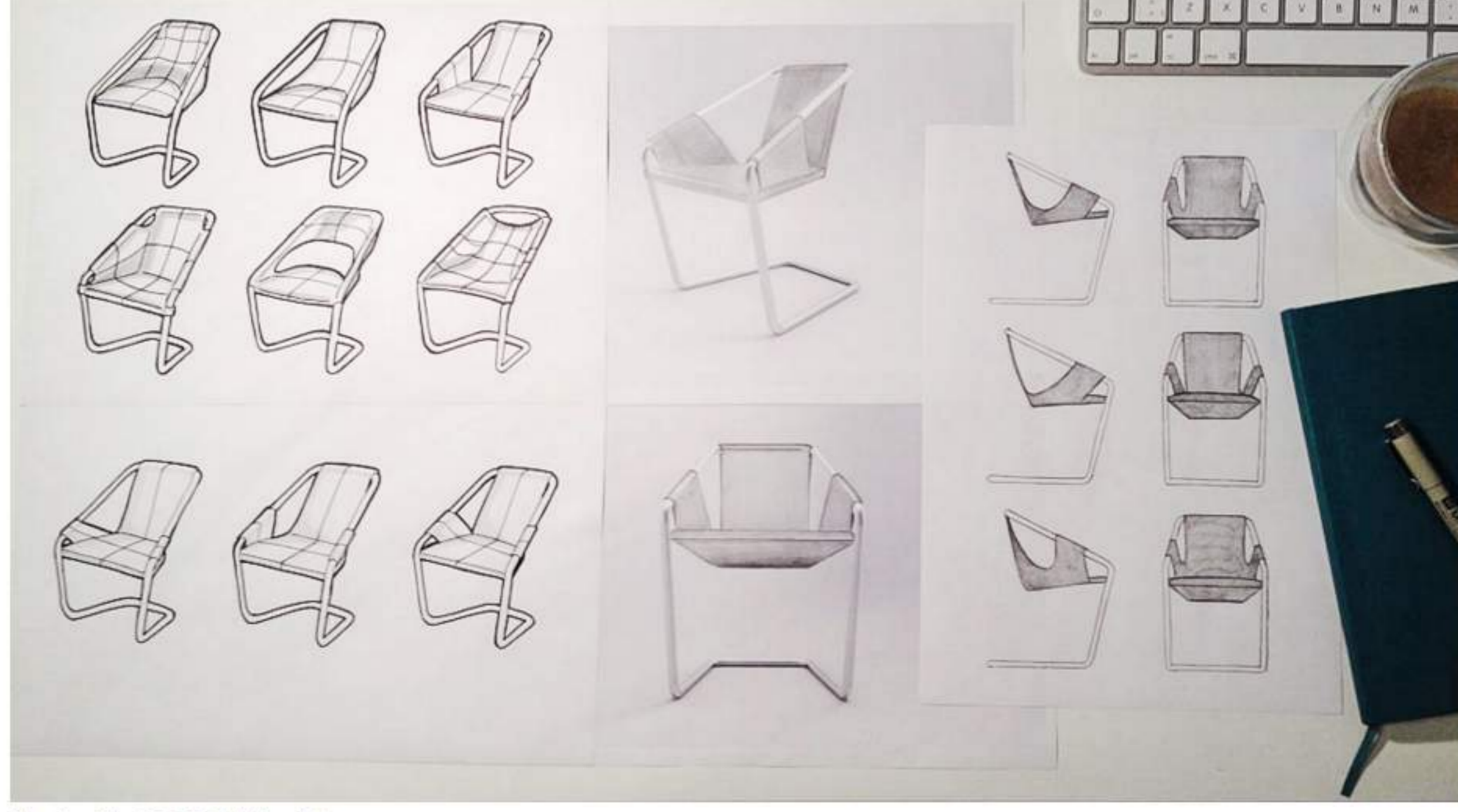
Sketches of the ODDSSON dining chair