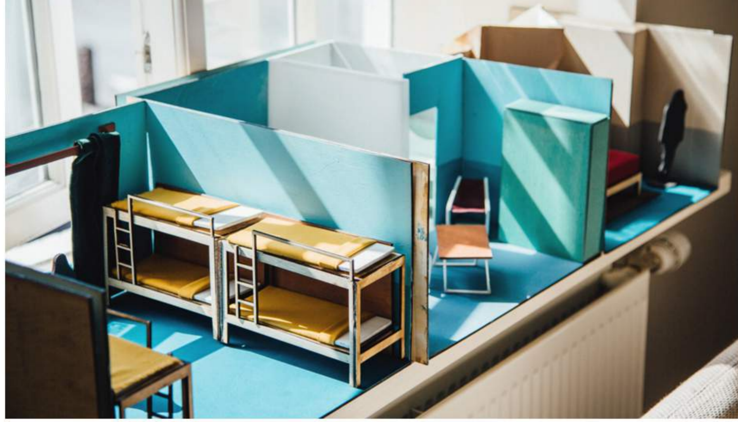
The mini models of the bunk, hostel and hotel rooms